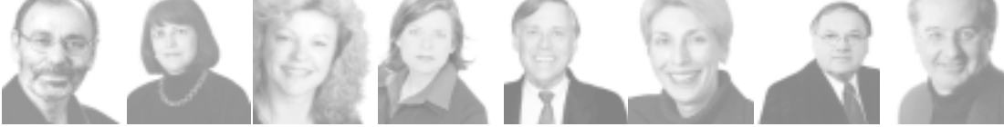
Jacques Bensimon Government Film Commissioner and Chairperson